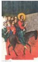
Blessed is he who comes in the name of the Lord

We open this most Holy Week continuing the theme of the cost of faithful obedience and the reality of suffering. It is easy to be enamored with the concept of love, but the truth is love is costly. Revelation is the story of God's great love for us. Today, we remember the cost of that love in Jesus' passion and death, and we ask ourselves where we fit in all of this. The answer is profoundly humbling, no matter who we are.