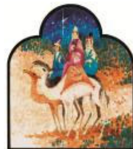
Magi from the east arrived