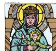
Blessed are You Among Women

Monday: Num 6:22-27; Ps 67:2-3,5,6,8; Gal 4:4-7; Lk 2:16-21