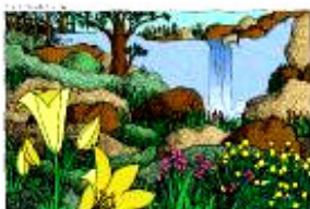
The Kingdom of Heaven Is at Hand.

In a chaotic world filled with personal, political and often environmental turmoil, it is easy to long for someone coming from the outside to help us, to “fix” things. But today we are reminded that something is also required of us. Preparing for Christ was and is a serious task, involving our own need for hope and repentance. We can look to Jesus for solace and assistance, but we are called to “make straight his paths” and to produce good fruit as evidence of our repentance.” His coming makes great demands on us.