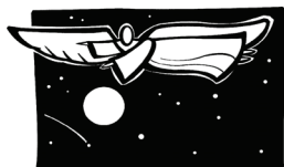
Glory to God in the highest

5:00 p.m. Mass 7:30 p.m. Mass Midnight Mass Vocation Office and Priests Retirement Collection